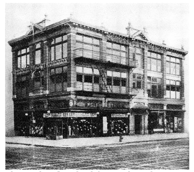
The School of Chiropody of NY

The New York College of Podiatric Medicine (NYCPM) will be celebrating its centennial anniversary on May 18, 2011. Among the many things being done to mark this momentous occasion are a gala party that will be held -- on almost the exact anniversary of the day that the College opened -- at the Grand Hyatt Hotel in Manhattan, and the publication of a book that recounts the century of events and people that went into making this great institution.