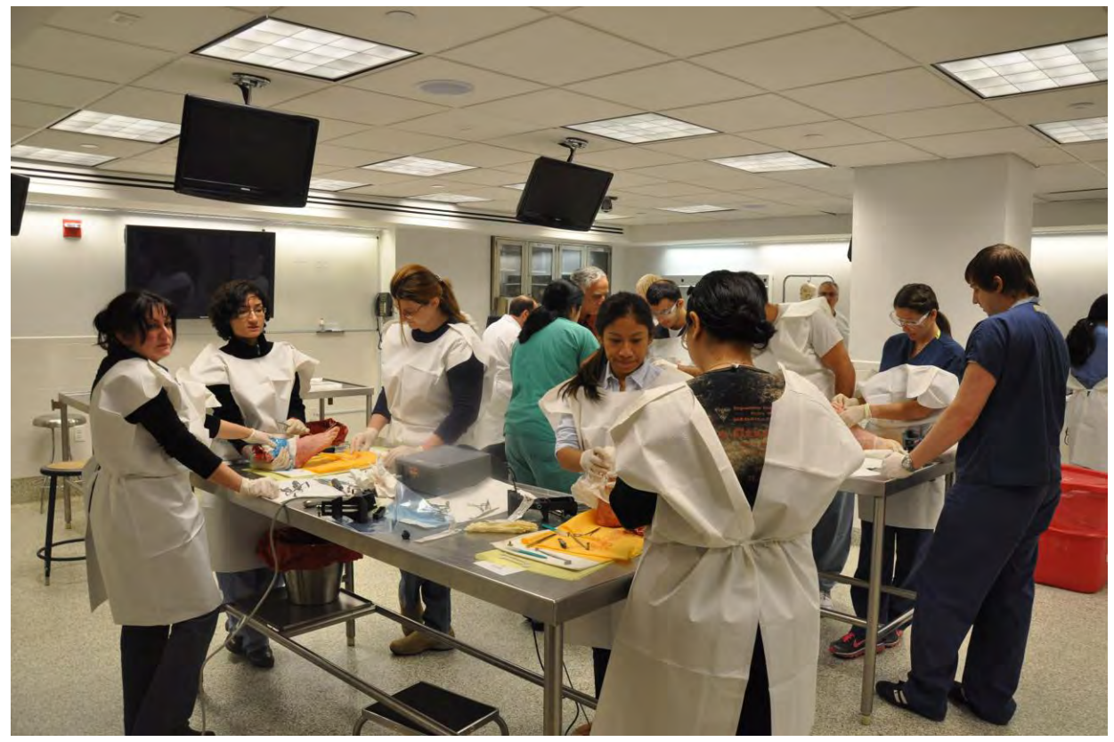
The Bako Pathology Anatomy Lab

Researching and writing the one-hundred-year history of The New York College of Podiatric Medicine presented a daunting, interesting, and exciting challenge. In order to have a complete picture of the growth of the College, it seemed necessary to place it within the context of the historical events of the 20th century in which the United States was involved, as well as the emergence of the profession of podiatry, and the changes that have taken place in New York State and New York City.